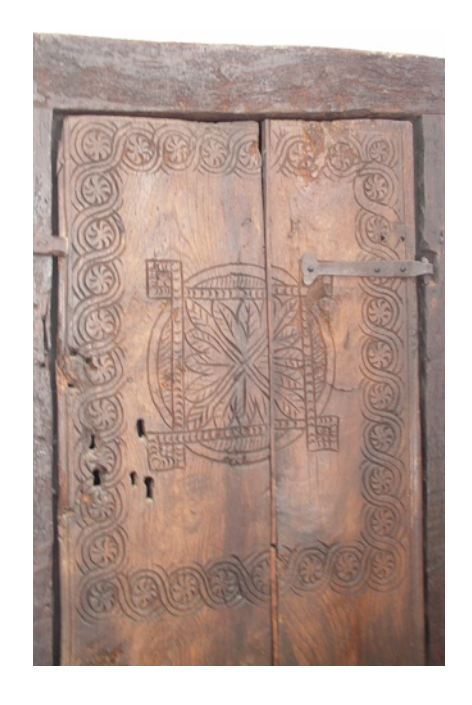
Fig. 5 Eastfield Farm, Lydford on Fosse, decorated door on first floor

The absence of the original roof structure makes interpretation difficult, but the plan appears to be a farmhouse of three rooms in line, comprising kitchen, hall and central unheated service room. Adjacent to the kitchen fireplace was a curing chamber (now gone) and access to the room above is by an elaborately carved door on the first floor (Fig. 5). Details of the beams indicate