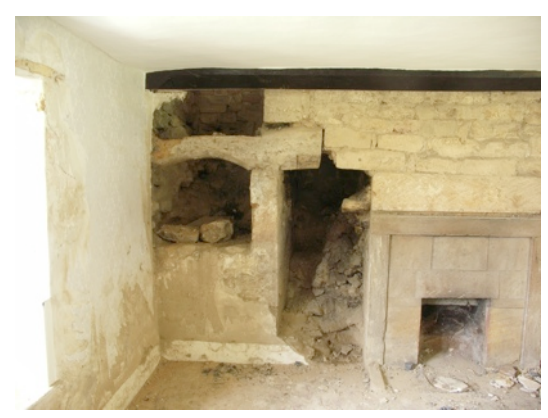
Fig. 7 Old Harp House, Over -Stratton, remains of bressumer and access to curing chamber

South Petherton, Over Stratton, Old Harp House (formerly South Harp Farm) ST 435150 The plan consists of three rooms in line with a cross-passage and stair turret. The original roof was destroyed by fire in the 19th century. The details of the beams and the stair turret suggest a date in the 16th century, and the proportions indicate that the room arrangement was much as