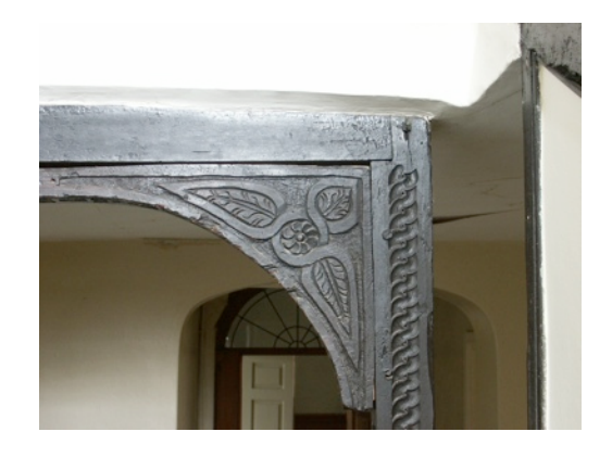
Fig. 9 Tintinhull House, spandrel at foot of back stair

The history of the estate is given in VCH, volume III (1974), and the house, listed Grade I, was described by Arthur Oswald in Country Life (19 April 1956). The parsonage estate, including