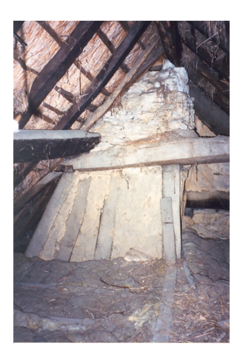
Fig. 4 Bramble Cottage, Haselbury Plucknett, smoke-hood

bly the curing chamber) were also built at this time.