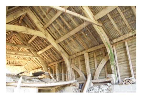
Fig. 1 Barn at Whitehall Farm, Combe St Nicholas

From the 16th century, Whitehall Farm formed part of the estate of the Dean and Chapter of Wells Cathedral. The main range originally comprised an inner room, hall, cross-passage and service room. The roof is of high status arch-braced trusses with a tier of curved windbraces and may have been open to view. It has been dated to c 1500 by comparison with treering dated roofs elsewhere in the county. The stairs may have been housed in a turret. At the end of the 16th century, the low end was rebuilt with a wider span as a kitchen, incorporating a curing chamber (and possibly a baking oven). The house was upgraded in the early 19th century when a new fireplace and stack were inserted. A projecting bay was added in the hall and a lateral fireplace and stack built to serve the hall chamber. Additions to the rear at the same time included a dairy with cheese loft over. Subsequently the house was divided at the crosspassage into two dwellings, but reverted to one in the 20th century. Of the former sixteenth-