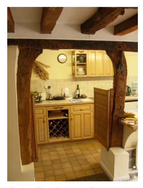
Fig. 2 Willow Cottage, Alhampton, 15th-century doorframe

Together the two houses now form an L-shaped plan. Willow Cottage comprises three groundfloor rooms on two levels and Canada House two rooms also on two levels. A room in each