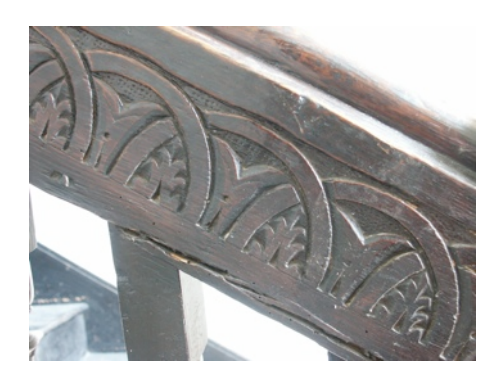
Figs 11 details of handrail to back stair

changes it is difficult to determine the original plan-form of Tintinhull House. The inscription '1630 N' on the gable of the cross-wing is likely to represent the date of the earliest phase of building and the conjecture is that it was two storeys and L-shaped (Figs 9-11) The house was enlarged to a rectangular plan with the addition of the two-and-half storey west front in classical style – described by the VCH as "an unusually perfect example of its period". This work was probably undertaken for Andrew Napper, who acquired the property by 1722 (Fig. 12). Further