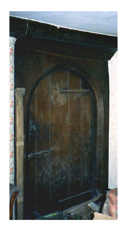
Fig. 6 Coombe Grange, Nailsea, 16th-century doorframe

ground floor, may have been used as a dairy. The house was significantly enlarged in the early 19th century by the construction of the parallel south range, the entrance aligned with the for-