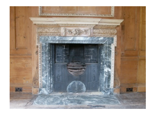
Fig. 12 Tintinhull House, 18thcentury chimney-piece

changes it is difficult to determine the original plan-form of Tintinhull House. The inscription '1630 N' on the gable of the cross-wing is likely to represent the date of the earliest phase of building and the conjecture is that it was two storeys and L-shaped (Figs 9-11) The house was enlarged to a rectangular plan with the addition of the two-and-half storey west front in classical style – described by the VCH as "an unusually perfect example of its period". This work was probably undertaken for Andrew Napper, who acquired the property by 1722 (Fig. 12). Further