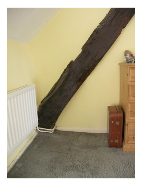
Fig. 3 Willow Cottage, Alhampton, principal rafter

house dates from the 15th century (based on tree-ring dating of similar features elsewhere in Somerset) (Figs 2 & 3) and the smokeblackening shows that they formed part of two open-hall houses. With the limited evidence available, it is not possible to establish the plan form of these medieval houses. In the second half of the 16th century, upper floors were inserted in one of the houses (now divided between the two cottages) and the other was ceiled late in the 16th century. The 1888 OS map indicates that the properties were then divided into three and extended further to the north and east.